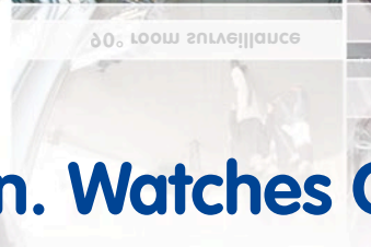
180° room surveillance