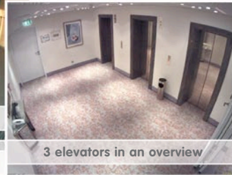
3 elevators in an overview